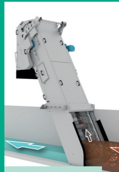
FRS III Filterscreen