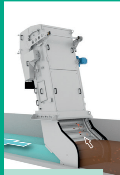
FRS III αβ Filterscreen